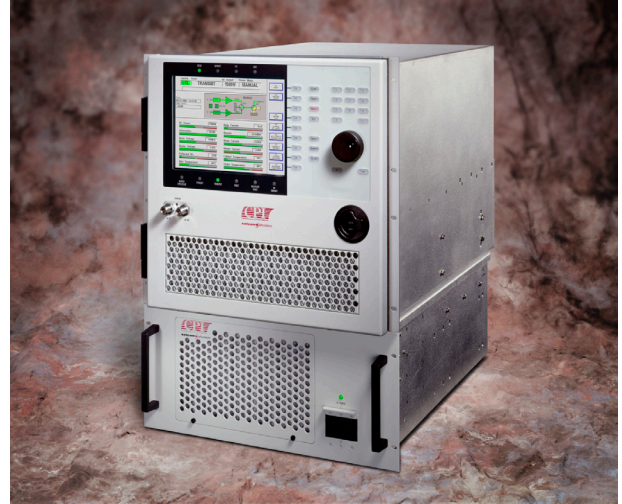
CPI 500 W L-band TWT, Model VZL2780C2

Backed by over 40 years of satellite communications experience, and CPI's worldwide 24-hour customer support network that includes more than 20 regional factory service centers.